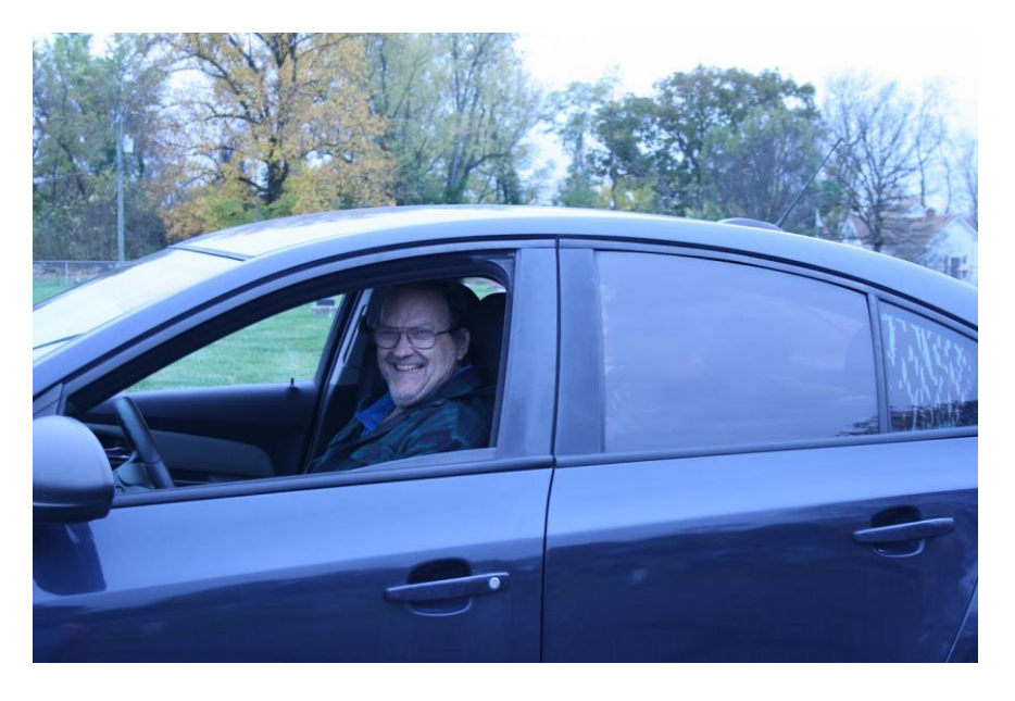
Having fun at the "Ghouls Rally"