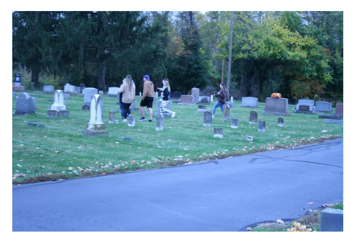
People having fun at the "Ghoul Rally"